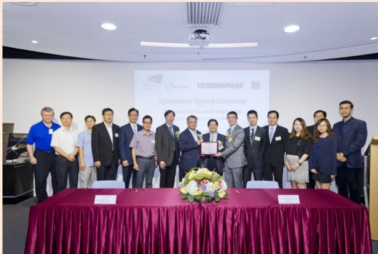
A group photo of representatives from CityU and RS at the ceremony