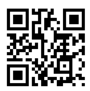
Scan the QR code for more details