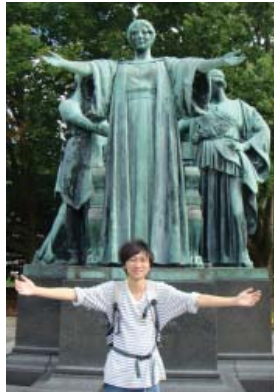
I love UIUC

I got four courses altogether with 12 credits. My first class was Power Electronics. Professors still used blackboard to conduct classes rather than power point. Another major difference was that most classmates did not speak Chinese, so I had to keep on speaking English all the time. Besides, there's much more homework to do in UIUC! I had to work very hard to complete them.