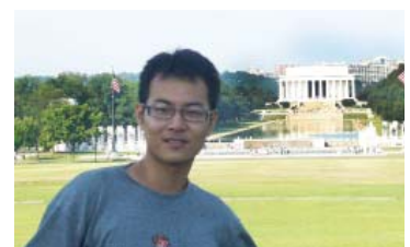
University of Maryland.

I give five solid stars to my exchange life in University of Maryland.