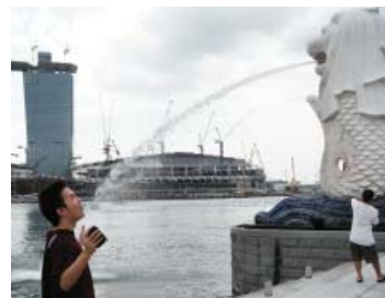
A visit to Merlion Park

would like to do during your time overseas. The entries can be local attractions, like Merlion Park or Botanic Garden in Singapore, or simply something you think too crazy to do here in Hong Kong, like “party until sunrise”, “sleep on the beach” or something even more fancy. Don’t bury yourself in the library all the time, you are here to experience and enrich your life. Making several trips out of the town could be a lot of fun, and it is a good way to make new friends. In addition, you will gain invaluable experience when planning the trip yourself. For me, I went to Indonesia, Malaysia and Thailand in my four months’ exchange, with friends from France, Finland, Korea, Austria, Taiwan and Mainland China. I believe they will be unforgettable moments all my life.